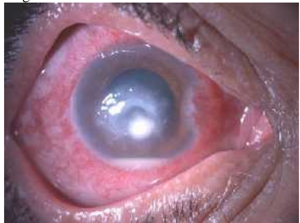
Figure 2: Corneal ulcer Poor prognostic factors for agriculture-related eye injuries are:

Infections of cornea due to filamentous fungi are a frequent cause of corneal damage in developing countries and can lead to corneal ulcers (Figure 2) and perforation and are difficult to treat. Microscopy is an essential tool in the diagnosis of these infections.